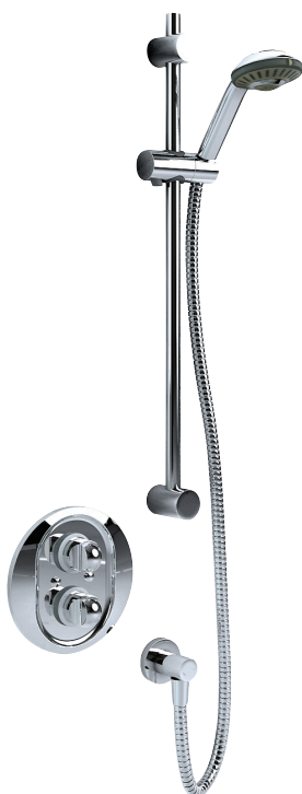
telo thermostatic concealed shower with flexible slide rail kit TL40014CP