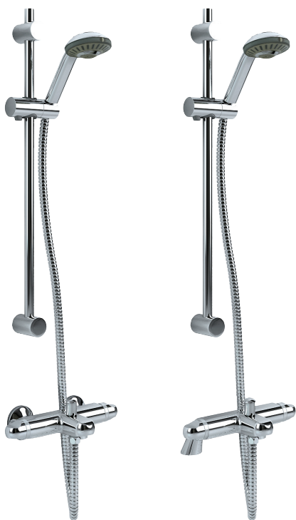
telo thermostatic bath shower mixer with flexible slide rail kit TL30014CP